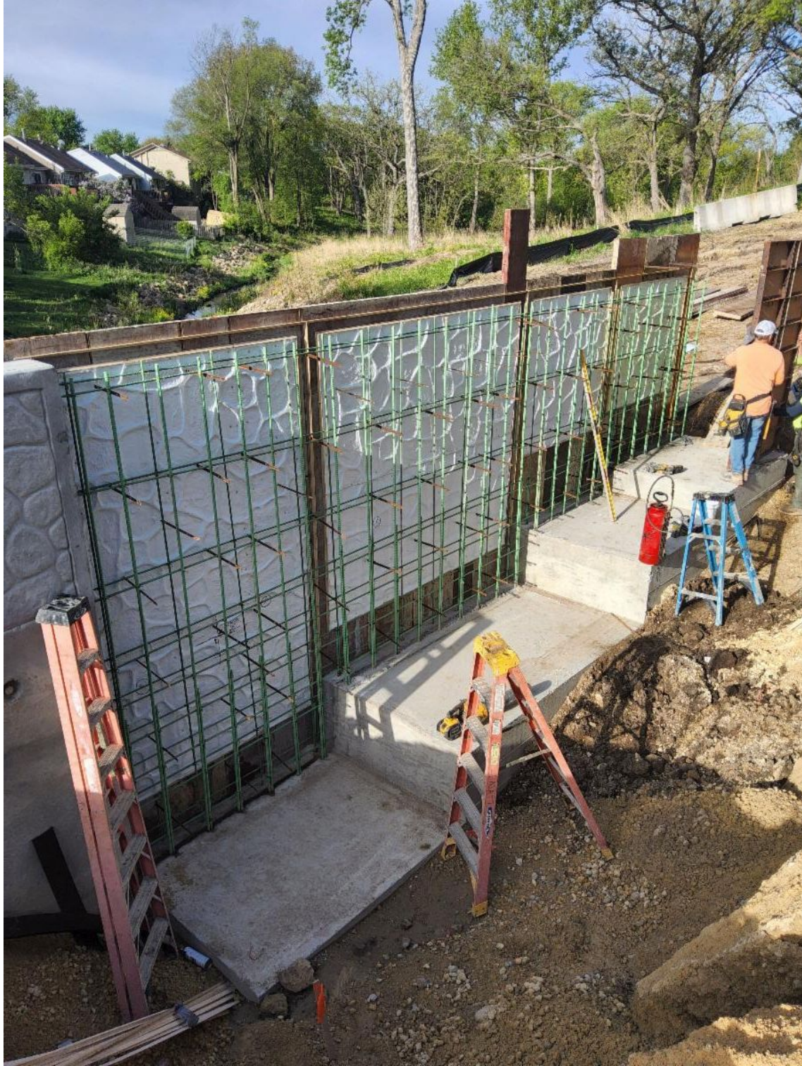
The crew preparing the framing, steel reinforcement and form liner for the cast-in-place retaining wall.