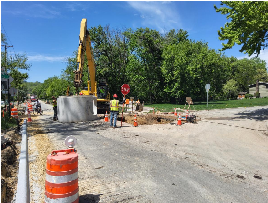
The crew installing an 8' diameter storm sewer manhole.