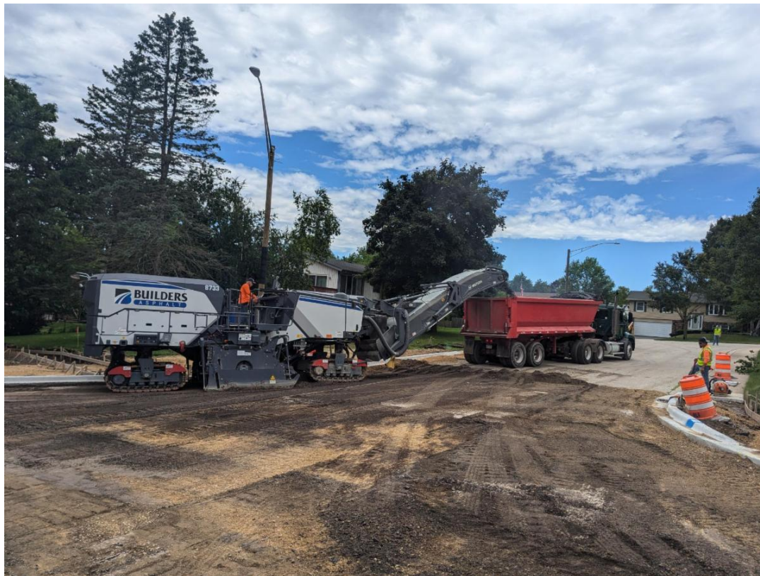
Crew milling the existing asphalt pavement at the Vista Drive and Souwanas Trail intersection.