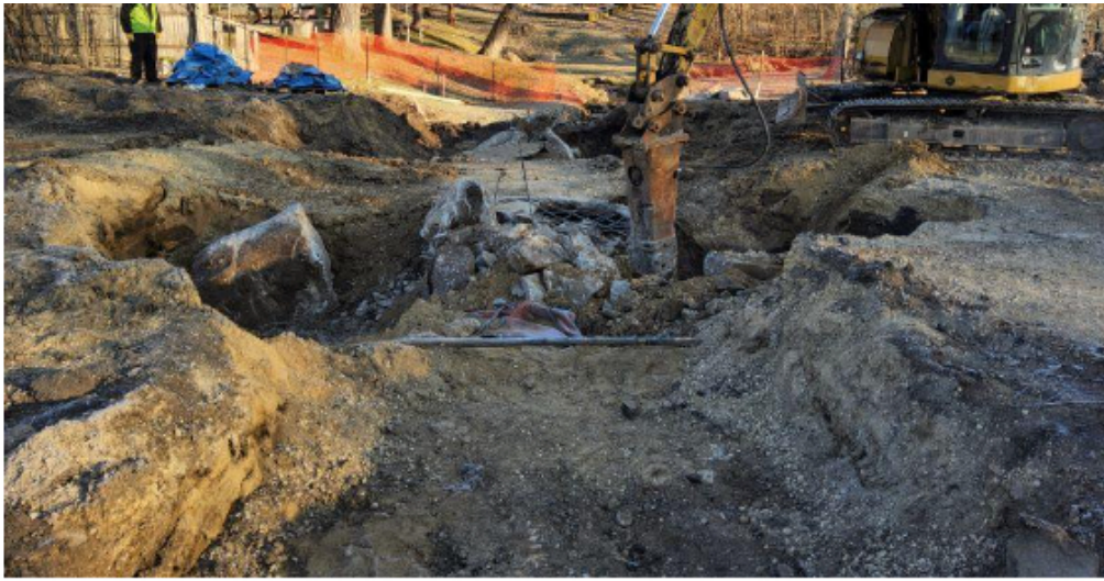
During last week's excavation the contractor discovered remains of an old bridge!