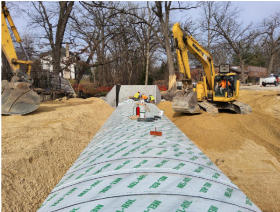
Installing the waterproof membrane