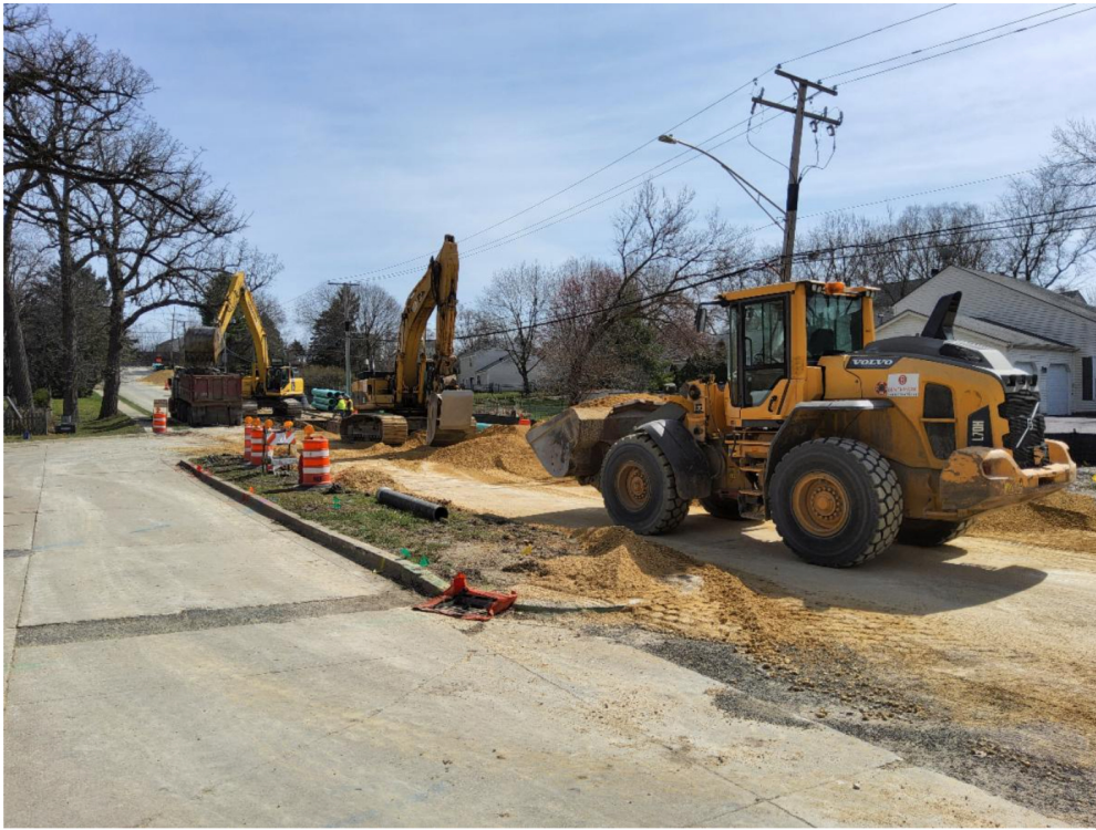
The "construction equipment train" the contractor has been using to install the 18" sanitary sewer.

Installing the 18" raw water feed at the Riverwood Drive and Souwanas Trail intersection.