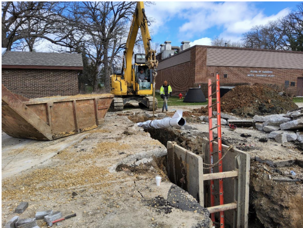
Installing the 10" raw water feed at the Riverwood Drive and Souwanas Trail