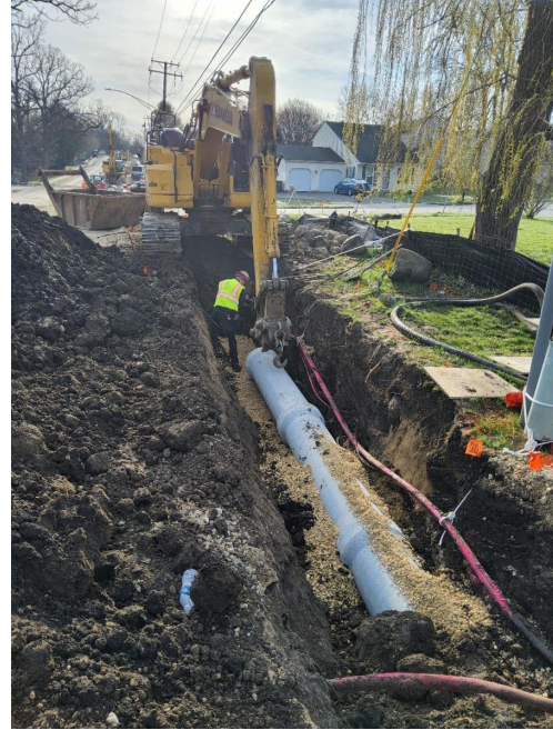
The crew installing storm sewer improvements near the intersection of Riverwood Drive and Souwanas Trail.