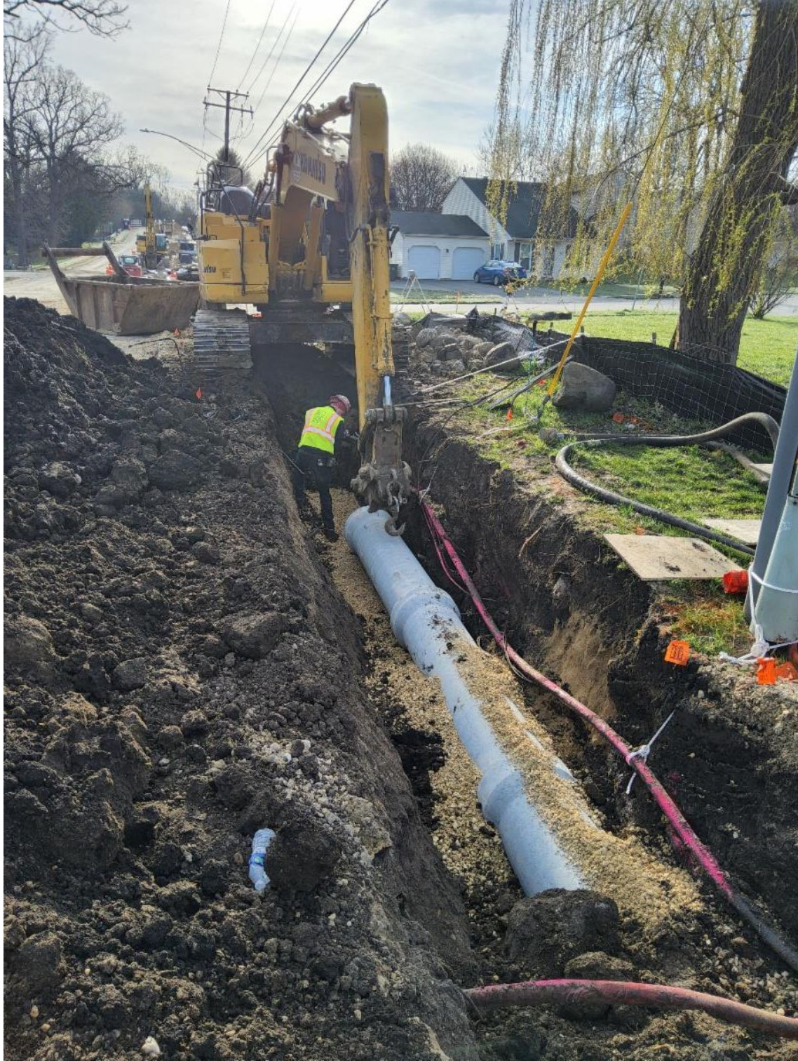
The crew installing storm sewer near the Riverwood Drive/Souwanas intersection.