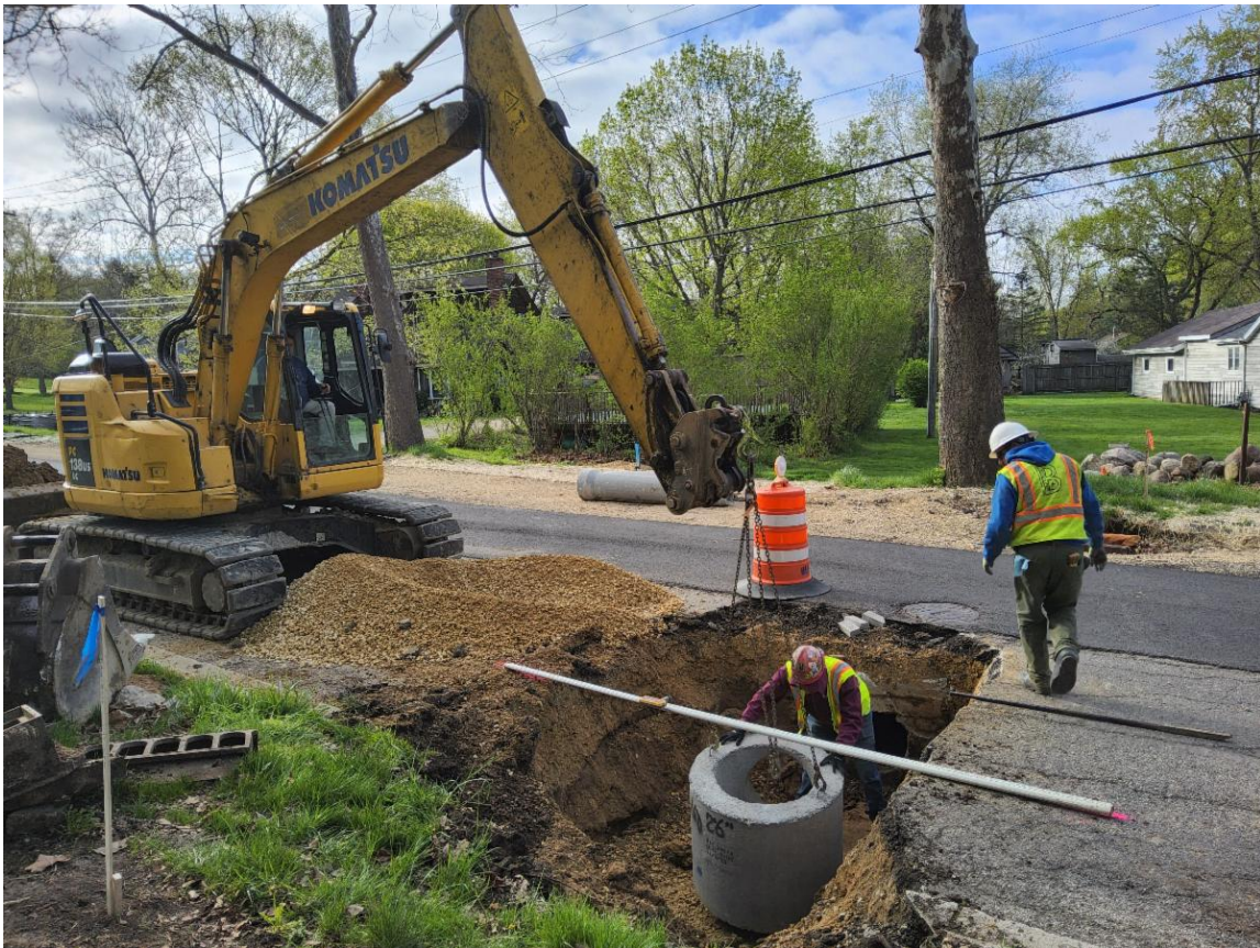
The crew installing storm sewer improvements on Souwanas Trail.