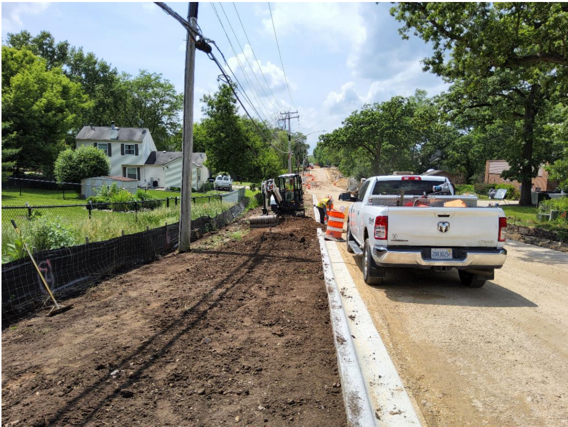
Crew preparing the south limits of Souwanas Trail for topsoil installation

Fun fact, a cast-in-place retaining wall employs removable concrete forms to construct a vertical concrete retaining wall!