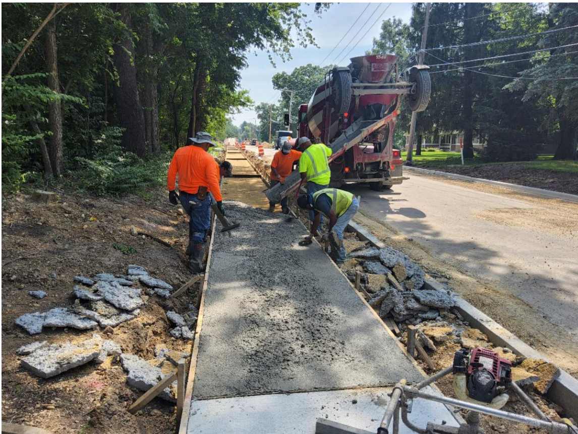
Crew pouring concrete for sidewalks along Souwanas Trail

Additional work included pouring concrete for driveways and curb and gutter along Oceola Drive as well as the installation of topsoil, seed, and an erosion control blanket along Souwanas Trail. An erosion control blanket is a biodegradable, open-weave blanket that provides temporary cover and support for establishing vegetation on bare soil areas. This work is part of the landscape restoration effort to repair areas distributed by construction activities.