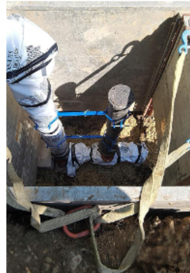
Fire Hydrant Installation