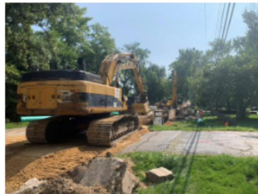
Construction equipment train used to install 18" sanitary sewer. These two excavators work together to excavate, set the pipe, and backfill the stone after the pipe is installed.

Over the next two weeks, the contractor will complete the transfer of water services to the new water main along Schuett Street. This transfer of service