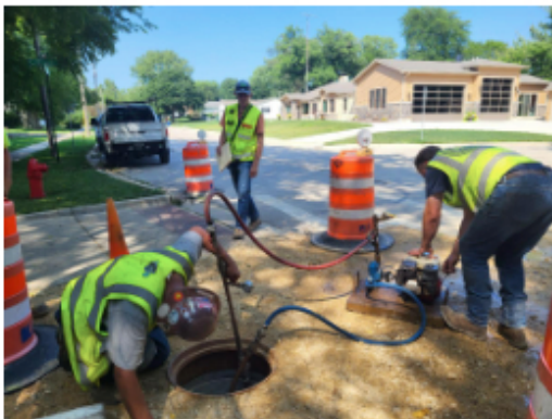
Construction team preparing and completing a pressure test of the new watermain along Schuett Street.