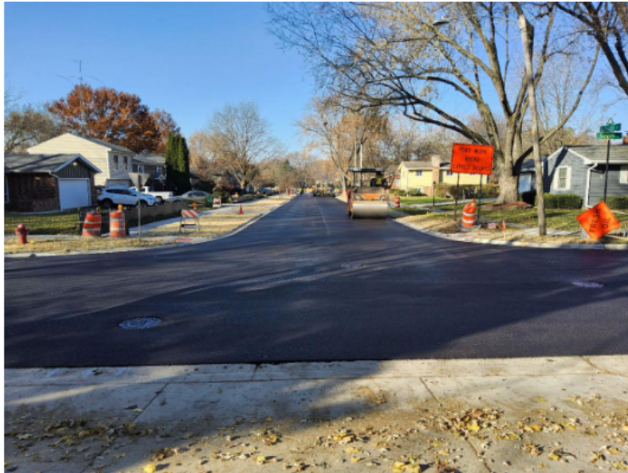
HMA Surface Along Schuett Street