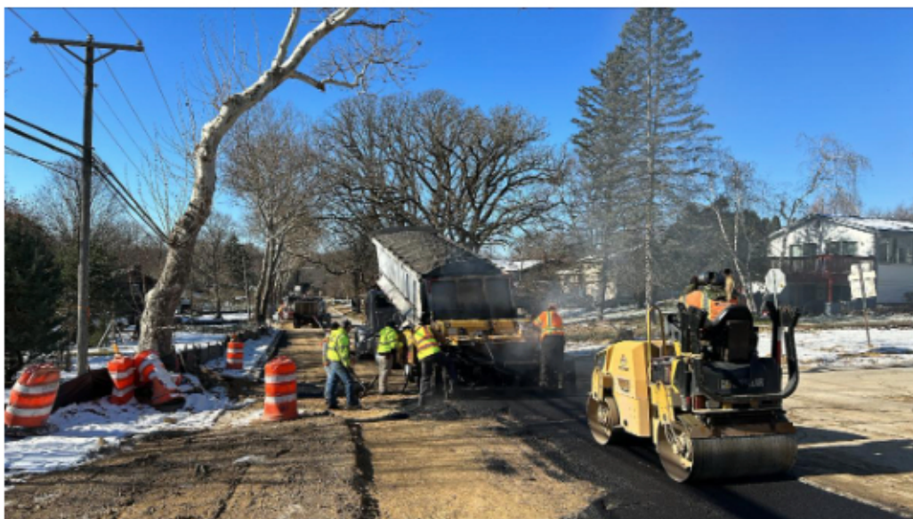
Temporary HMA placement on Souwanas Trail