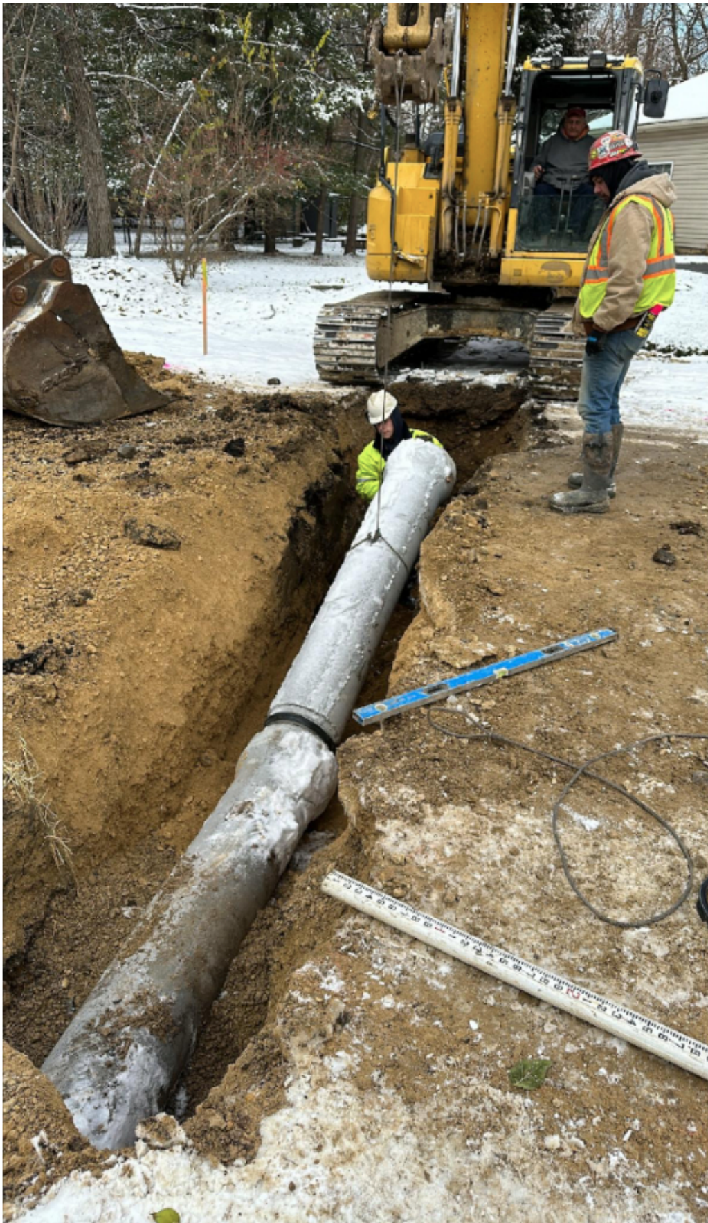
Storm sewer installation on Souwanas Trail