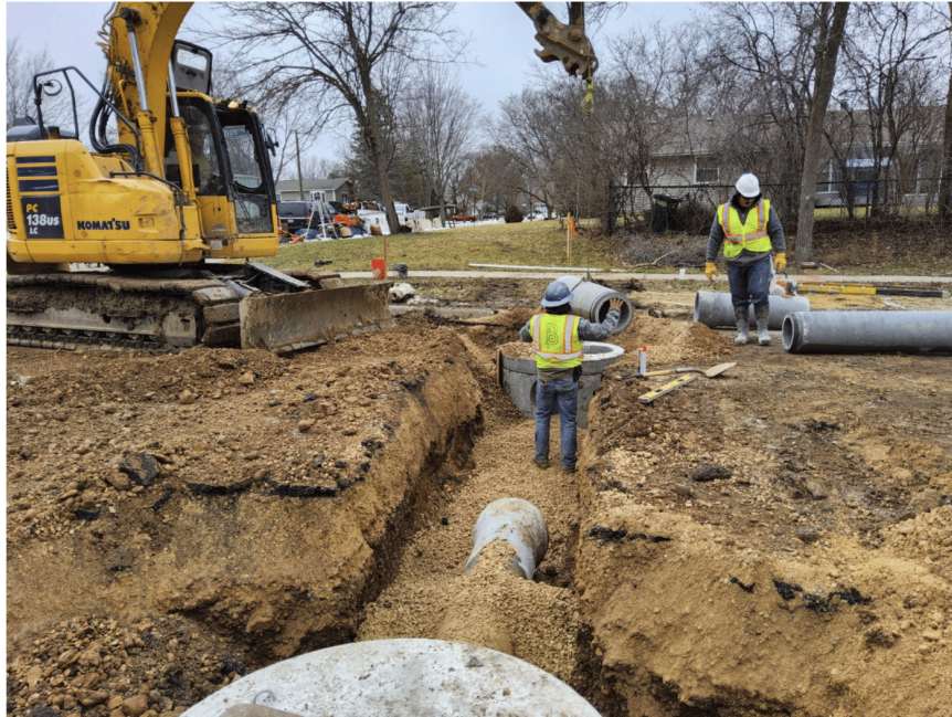
12" storm sewer installation near the Souwanas Trail and Carriage Drive intersection