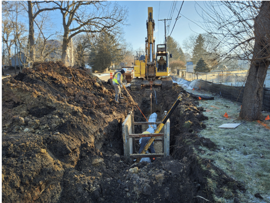
10" watermain installation along Souwanas Trail

Happy New Year! The contractor has been back at work following the holiday season. In the last two weeks the contractor has: